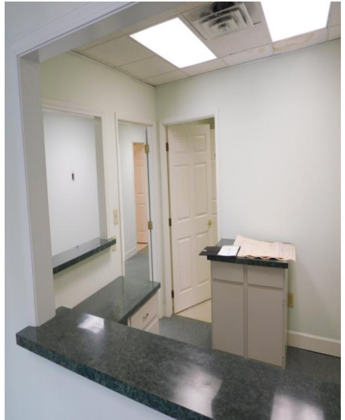
Large reception area for patients and visitors