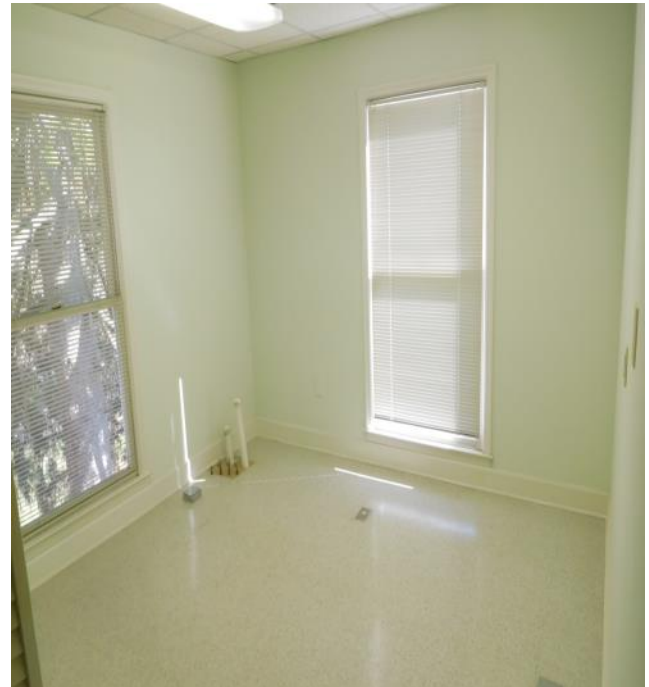
One of two offices - - with private exit on one